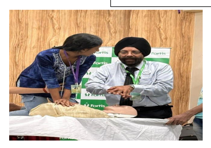
Health Checkup Camp