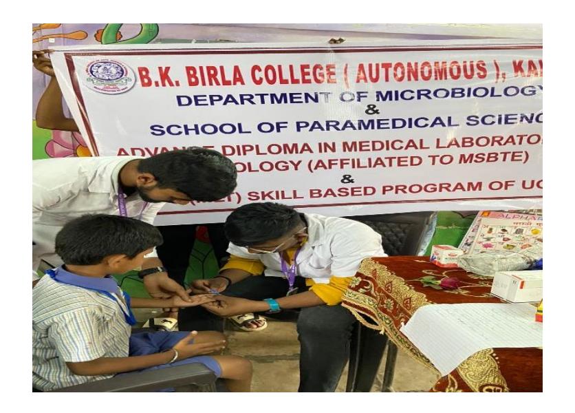
Blood Group Detection Camp at Samarth Vidyalaya